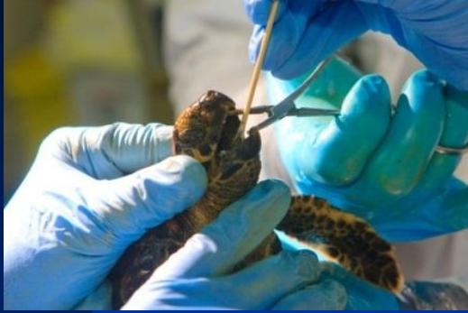
Deepwater Horizon (2011)