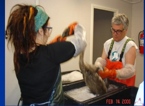
Mystery Spill (Estonia, 2006)