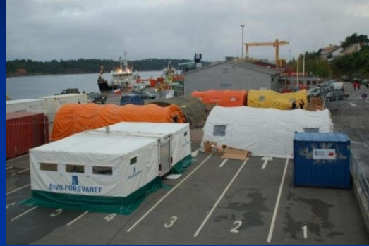
Full City (Norway, 2009)