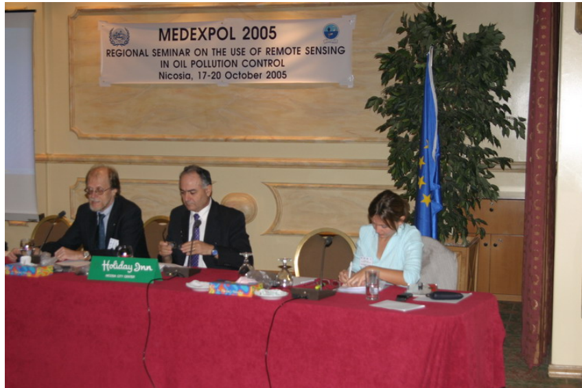
Opening of the Seminar