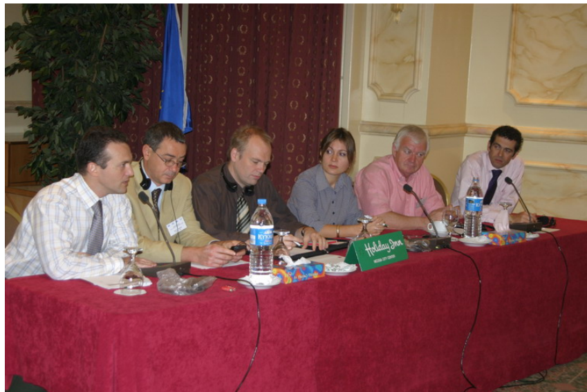
Speakers during discussion