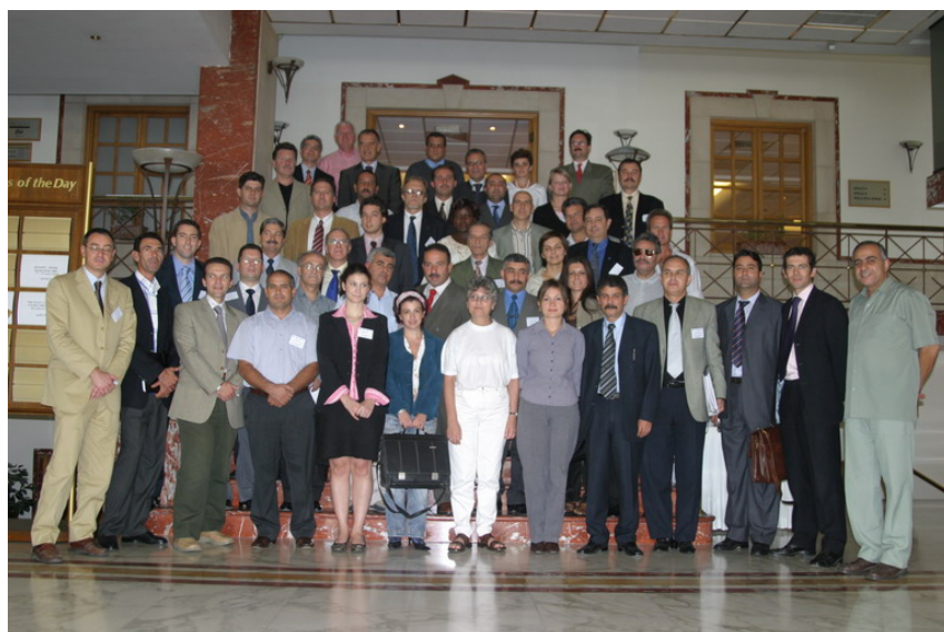
Participants and speakers at the end of the Seminar